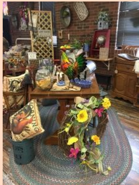
And Blooming Sensations has opened in the Old Library in downtown Beattyville!

It's great to see so many new and expanded businesses in our KYMS communities!