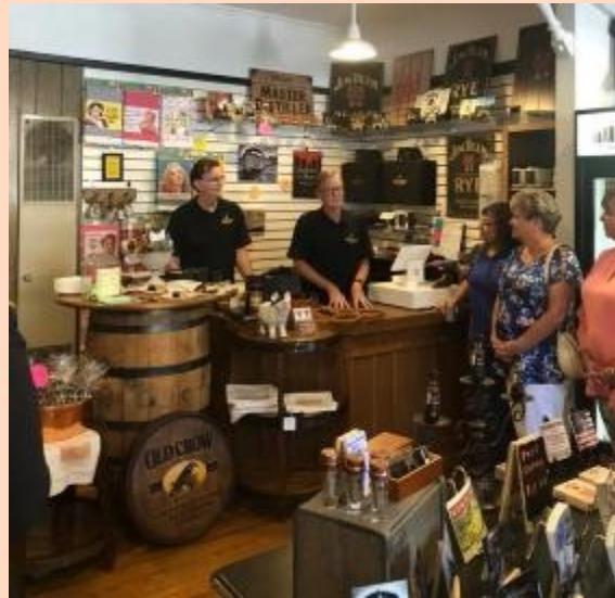
There's a new store to visit in Bardstown! The Kentucky Bourbon Marketplace is now open.