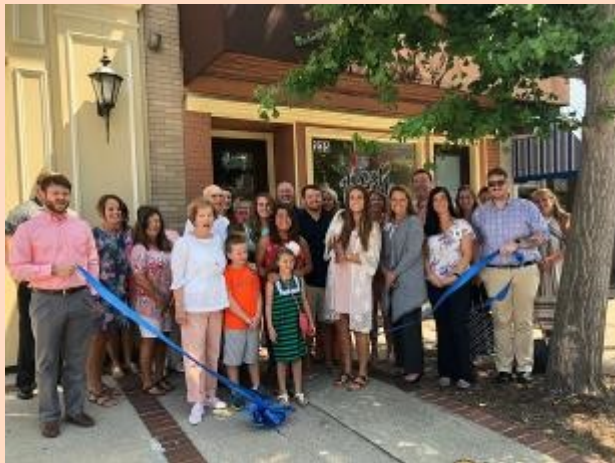
Posh Apparel had a ribbon cutting July 25th they are located at 235 West Main in Danville!