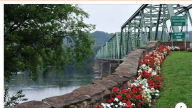
HOUSEBEAUTIFUL.COM 50 Charming American Towns You've Never Heard Of Hit the roads less traveled.

Should you have any questions, please contact the KLC Legal Department at 800-876-4552